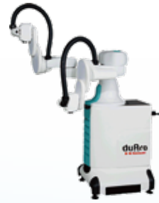
Dual-arm SCARA robot