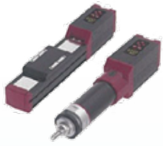
Single axis robot