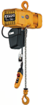
Electric chain hoist